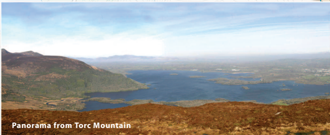
Panorama from Torc Mountain

Seventy feet of furious, falling, foaming water and part of the Owengarriff river which rises in the Devil's Punchbowl on top of Mangerton mountain, Torc waterfall gives pleasure to the 'medium' walker in this area.